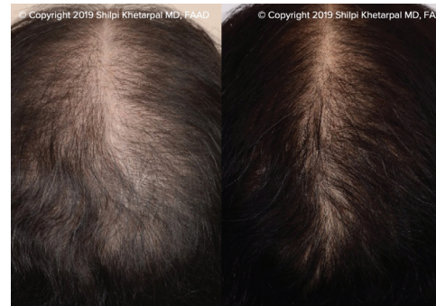
*Before (Left)/After 5 PRP Treatments (Right)