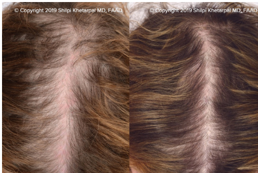
*Before (Left)/After 2 PRP Treatments (Right)