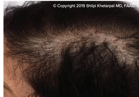
*Before PRP Treatments