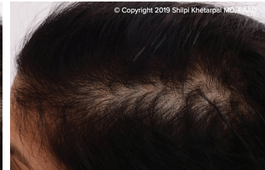
*After 2 PRP Treatments