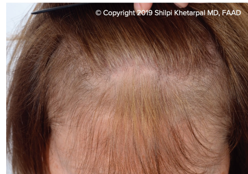
*Before PRP Treatments