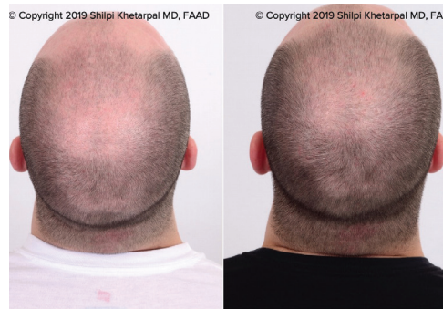
*Before (Left)/After 2 PRP Treatments (Right)