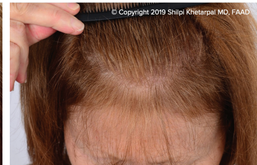
*After 3 PRP Treatments