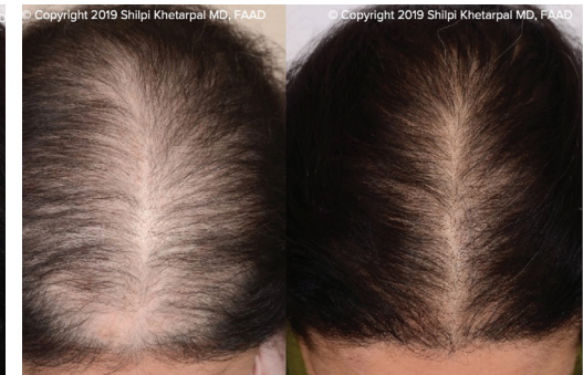
*Before (Left)/After 5 PRP Treatments (Right)